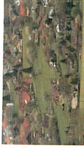
Gain eligibility for the LDC Community Design Awards Program

For more information about the LDC contact HBAM at 410-265-7400